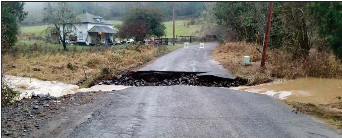
Figure 1: Disaster Damage, Holbrook Road; Columbia County, Oregon