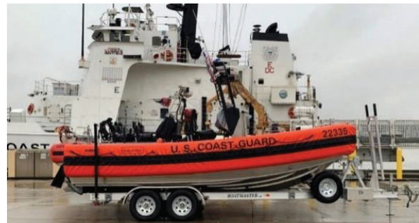
Non-Capitalized Personal Property Asset, Large Cutter Boat