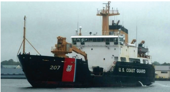
Capitalized Personal Property Asset, 225-Foot Seagoing Buoy Tender

The Coast Guard classifies personal property that meets capitalization criteria as capitalized or non-capitalized. The following photos depict an example of capitalized property (left photo) and an example of non-capitalized personal property (right photo).