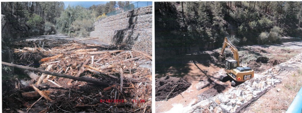
Figure 1: North Road Drainage Site

The County is located on the Pajarito Plateau, approximately 90 miles north of Albuquerque. In September 2013, torrential rain and flooding damaged the County's reservoir, landfill, roads, and drainage facilities (see figure 1).