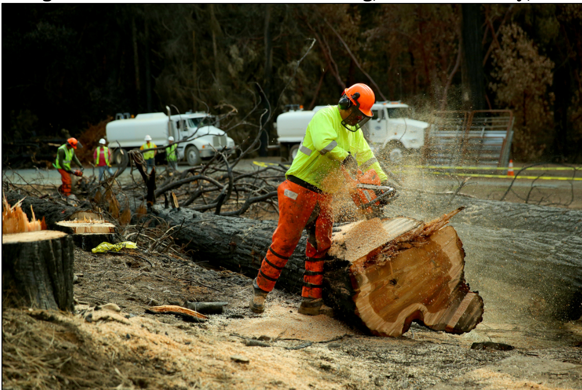
Figure 1: Debris Removal and Tree Falling, Calaveras County, CA

On September 9, 2015, the Butte Fire swept through several communities in Northern California and continued to burn for 22 days. It was the seventh-most destructive wildfire in California's history. At its peak, nearly 5,000 firefighters battled the blaze, and resources included 519 fire engines, 18 helicopters, 8 air tankers, 92 hand crews, 115 bulldozers, and 60 water tenders. In Calaveras County, the fire burned 70,868 acres and destroyed 863 structures, including 475 homes.