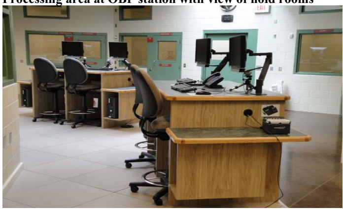
Processing area at OBP station with view of hold rooms