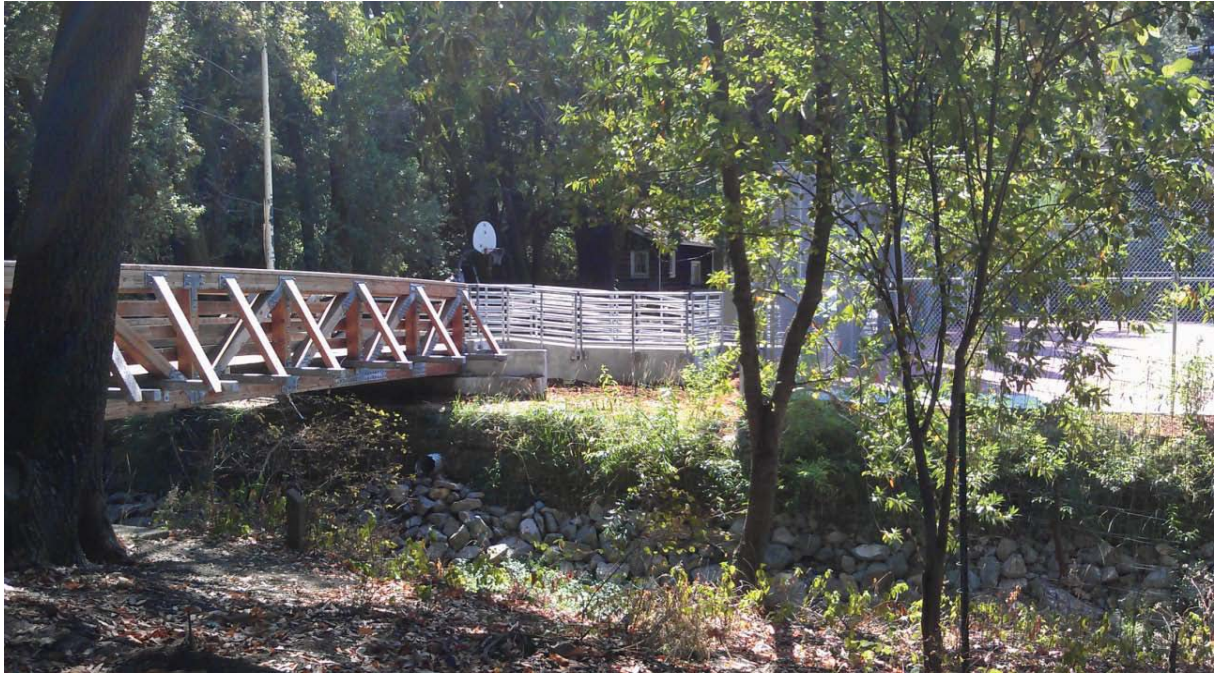
Project 3041 – replacement bridge (left) and Project 2330 – tennis court and embankment repair (right)

Therefore, we question as ineligible $345,217 in excessive and unreasonable costs for Projects 2330, 2338, 2345, and 3041.